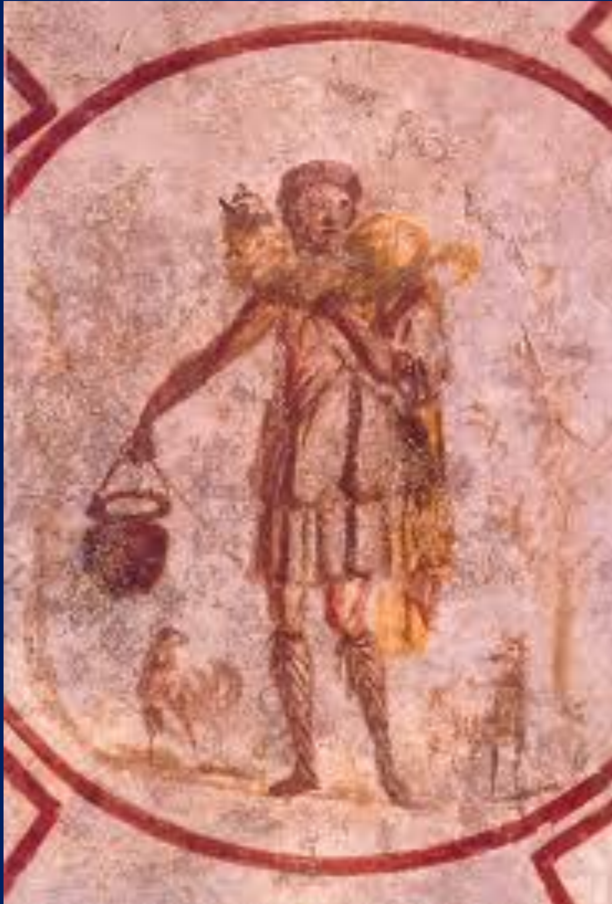
Jesus, the Good Shepherd. Catacomb of Callixtus/Callisto